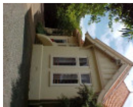
H01178 myrniong side feb2003