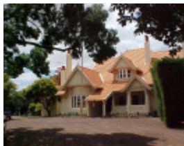
H01178 1 myrniong front feb2003