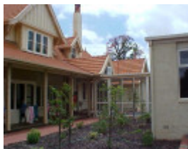
H01178 myrniong feb2003