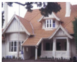
h01178 myrniong cnr kent and macarthur st hamilton front view lshe project 2003