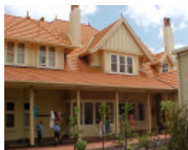
H01178 myrniong back feb2003