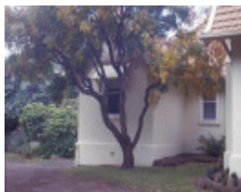
h01178 myrniong cnr kent and macarthur st hamilton rear roof line she project 2003