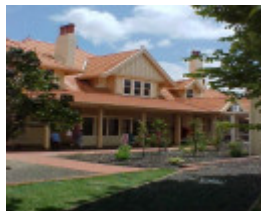
H01178 myrniong back2 feb2003