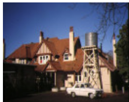
H01178 myrniong hensley park road hamilton front view aug1994