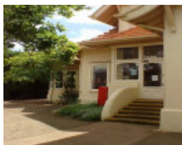
H01178 myrniong side2 feb2003