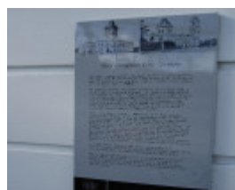
4679 Town Hall 1251 High Street Malvern History Plaque 1