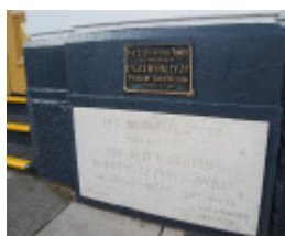
4679 Town Hall 1251 High Street Malvern Plaque 1