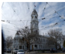
4679 Town Hall 1251 High Street Malvern View North East 1