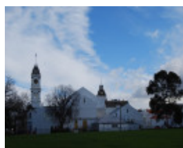
4679 Town Hall 1251 High Street Malvern Rear 1