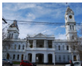
4679 Town Hall 1251 High Street Malvern View East 1