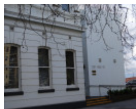
4679 Town Hall 1251 High Street Malvern Addition at Rear 1