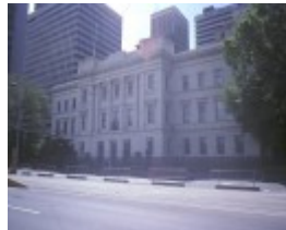
1 former customs house 400 flinders street melbourne front view nov1984