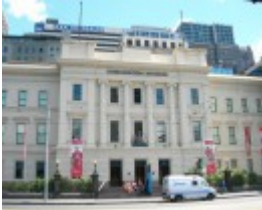
FORMER CUSTOMS HOUSE SOHE 2008