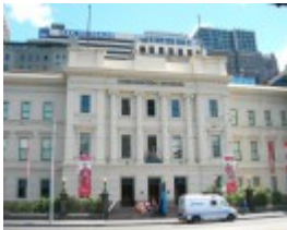
FORMER CUSTOMS HOUSE SOHE 2008