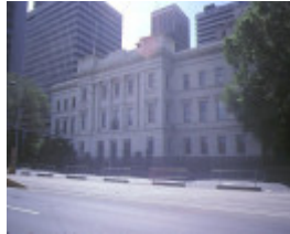
1 former customs house 400 flinders street melbourne front view nov1984