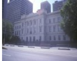
1 former customs house 400 flinders street melbourne front view nov1984