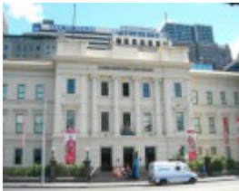
FORMER CUSTOMS HOUSE SOHE 2008