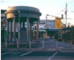
Kew War Memorial 2003