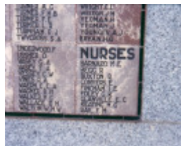
Kew War Memorial Honour Board 2004