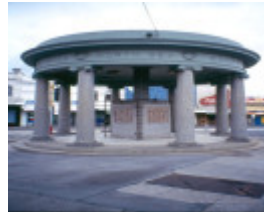
Kew War Memorial 2004