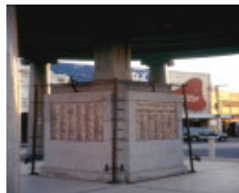
Kew War Memorial Honour Board 2004