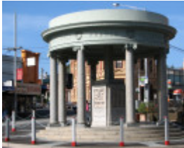
KEW WAR MEMORIAL SOHE 2008