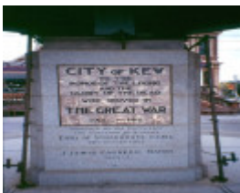
Kew War Memorial Honour Board 2004