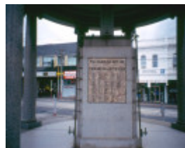
Kew War Memorial Honour Board 2004