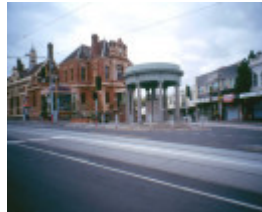
Kew War Memorial 2004