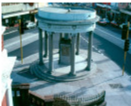
Kew War Memorial 2004