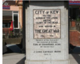
KEW WAR MEMORIAL SOHE 2008