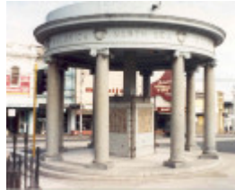
h02035 1 kew war memorial