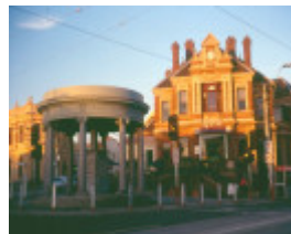
Kew War Memorial 2004