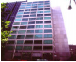
1 eagle hse 473bourke st elevation dw April 1998