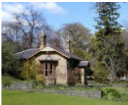
fitzroy gardens east melbourne cottage she project 2004