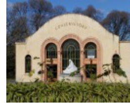
fitzroy gardens east melbourne conservatory she project 2004