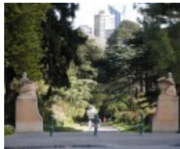
fitzroy gardens east melbourne path she project 2004