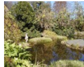
fitzroy gardens east melbourne pond she project 2004