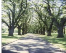
1 fitzroy gardens elm avenue