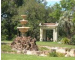
FITZROY GARDENS SOHE 2008