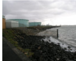
GELLIBRAND PIER AND BREAKWATER PIER SOHE 2008