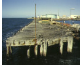
1 gellibrand pier & breakwater pier point gellibrand williamstown breakwater pier dec1994