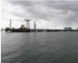
GELLIBRAND PIER AND BREAKWATER PIER SOHE 2008