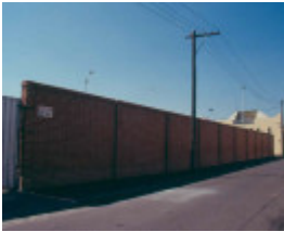
h01687 fitzroy pool wall