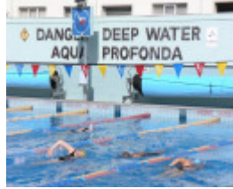
"AQUA PROFONDA" SIGN, FITZROY POOL SOHE 2008