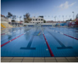
Aqua Profonda Sign, Fitzroy Pool