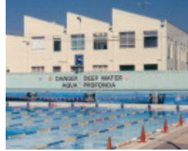
h01687 aqua profunda sign fitzroy pool