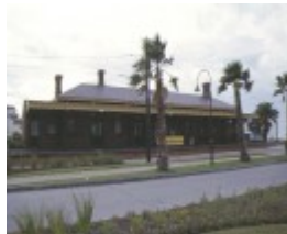
1 railway station complex beach road port melbourne front elevation mar1999