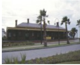
1 railway station complex beach road port melbourne front elevation mar1999