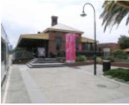
PORT MELBOURNE RAILWAY STATION SOHE 2008