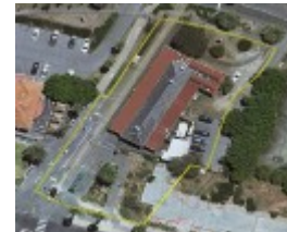
H0983 air photo 21-11-2017.JPG