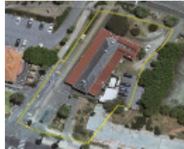
H0983 air photo 21-11- 2017.JPG