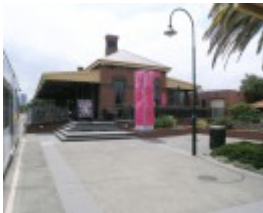
PORT MELBOURNE RAILWAY STATION SOHE 2008