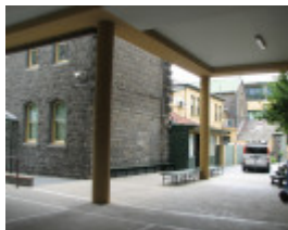
CONVENT OF MERCY AND ACADEMY OF MARY IMMACULATE SOHE 2008