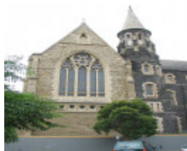
CONVENT OF MERCY AND ACADEMY OF MARY IMMACULATE SOHE 2008