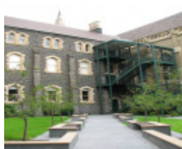
CONVENT OF MERCY AND ACADEMY OF MARY IMMACULATE SOHE 2008