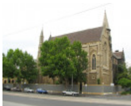
CONVENT OF MERCY AND ACADEMY OF MARY IMMACULATE SOHE 2008