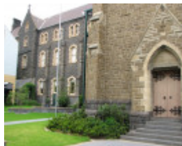
CONVENT OF MERCY AND ACADEMY OF MARY IMMACULATE SOHE 2008