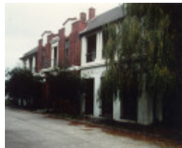
H01098 rafa barracks 1995