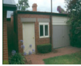
h01098 rafa barracks captain s quarters outhouse 2002