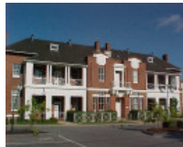
h01098 1 rafa barracks 2001