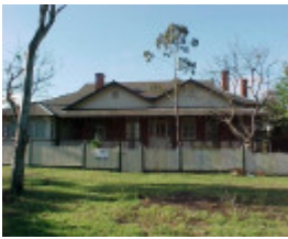
Rafa Barracks 1 Ordnance Reserve