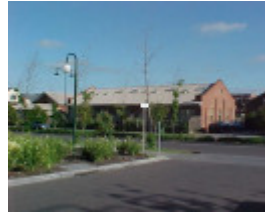
H01098 rafa barracks gun shed 2001pm1