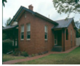
h01098 rafa barracks captain s quarters 2002