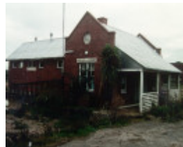
H01098 rafa barracks horse hospital demolished 1995