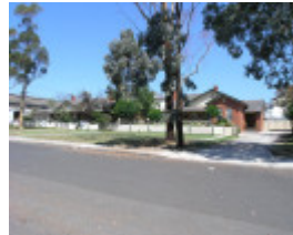
FORMER ROYAL AUSTRALIAN FIELD ARTILLERY BARRACKS SOHE 2008