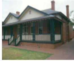
h01098 rafa barracks commandant s house 2002