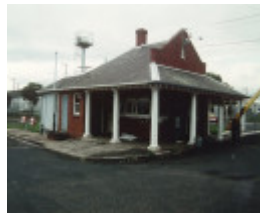
H01098 rafa barracks guard room 1995