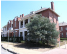
FORMER ROYAL AUSTRALIAN FIELD ARTILLERY BARRACKS SOHE 2008