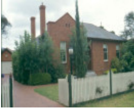
h01098 rafa barracks single men s quarters 2002