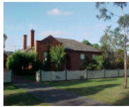
Rafa Barracks 3 Ordnance Reserve