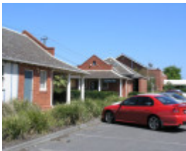
FORMER ROYAL AUSTRALIAN FIELD ARTILLERY BARRACKS SOHE 2008