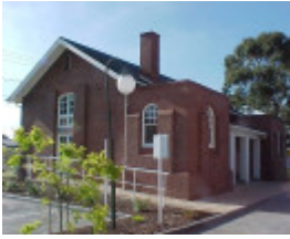
H01098 rafa barracks qstore infirmary 2001 pm1