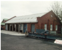
H01098 rafa barracks gun shed 1995