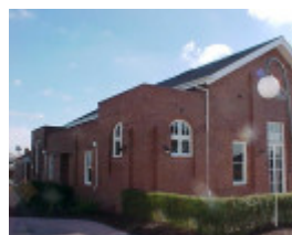
H01098 rafa barracks gymnasium 2001 pm1