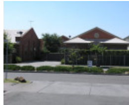
FORMER ROYAL AUSTRALIAN FIELD ARTILLERY BARRACKS SOHE 2008