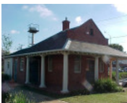
H01098 rafa barracks guard room 2001 pm1