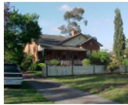
Rafa Barracks 2 Ordnance Reserve