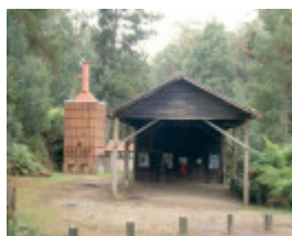
H02012 kurth kiln and storage shed