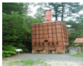
KURTH KILN SOHE 2008