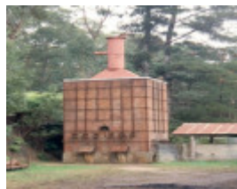
H02012 kurth kiln