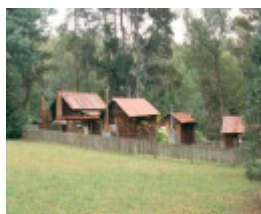
H02012 kurth kiln huts