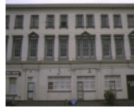
former eastern hill hotel victoria parade fitzroy front view