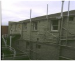
former eastern hill hotel victoria parade fitzroy rear view