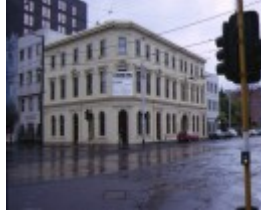
1 former eastern hill hotel victoria parade fitzroy corner view