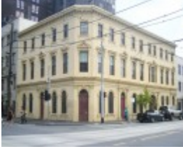
FORMER EASTERN HILL HOTEL SOHE 2008