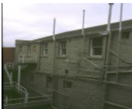
former eastern hill hotel victoria parade fitzroy rear view