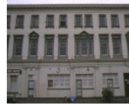
former eastern hill hotel victoria parade fitzroy front view