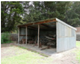
FORMER BLACKSMITH'S COTTAGE AND SHOP SOHE 2008