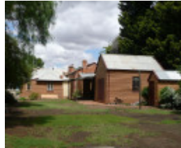
FORMER BLACKSMITH'S COTTAGE AND SHOP SOHE 2008