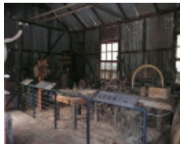
FORMER BLACKSMITH'S COTTAGE AND SHOP SOHE 2008