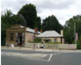
FORMER BLACKSMITH'S COTTAGE AND SHOP SOHE 2008