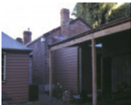
former blacksmiths cottage & shop main street bacchus marsh rear of shop 1997