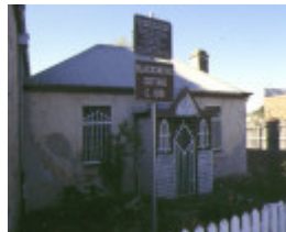
1 former blacksmiths cottage & shop main street bacchus marsh front view of cottage 1997