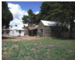
former blacksmiths cottage & shop main street bacchus marsh view of property dec1978