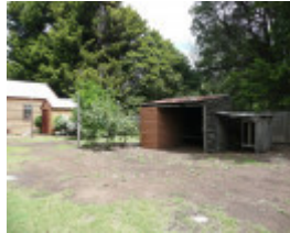
FORMER BLACKSMITH'S COTTAGE AND SHOP SOHE 2008