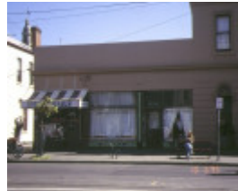
1 park street/emerald hill estate south melbourne 242- 244 park street front view oct1995