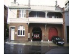
1 hawthorn fire station front view