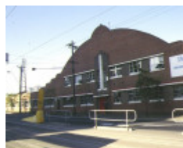
1 former burge bros factory racecourse road flemington front view jun1996