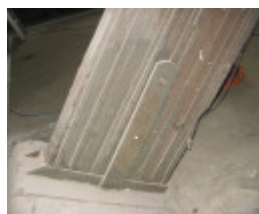
glue laminated beam abutment