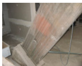
glue laminated beam abutment