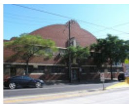
FORMER BURGE BROS FACTORY SOHE 2008