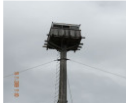
4932_Stringers_Knob_Fire_Sp 4932_Stringers_Knob_Fire_Sp 4932_Stringers_Knob_Fire_Sp