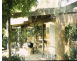
1 solar house rosco drive templestowe side view dec1996