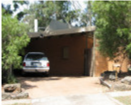
SOLAR HOUSE SOHE 2008