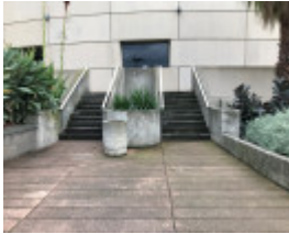
2017 stairs from Arts Centre Lawn to Hamer Hall.jpg