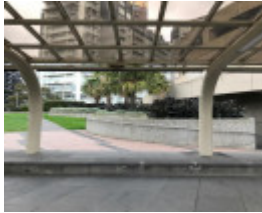
2017 garden beds next to Hamer Hall.jpg