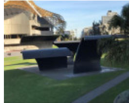
2017 Forward Surge .jpg