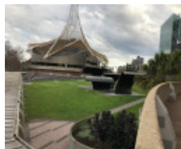
2017 view towards to Arts Centre.jpg