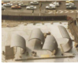
1981 During installation.gif