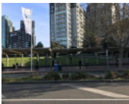
2017 from St Kilda Road.jpg