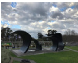
2017 view towards St Kilda Road.jpg