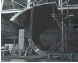
1975-6 Forward Surge under construction .gif