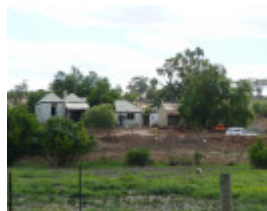
FORMER LEAHY'S RESIDENCE SOHE 2008