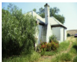
former leaky's residence millers road bacchus marsh side view