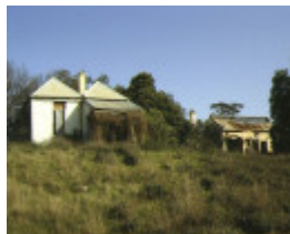
1 former leaky's residence millers road bacchus marsh front view of property aug1992