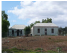
FORMER LEAHY'S RESIDENCE SOHE 2008