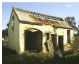
former leaky's residence millers road bacchus marsh stables aug1992