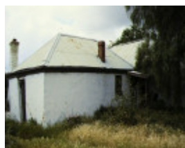
former leaky's residence millers road bacchus marsh rear view