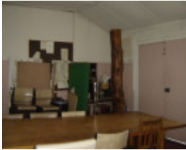
H1343 Interior of kitchen extension. Dec 2006.