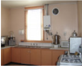
H1343 Interior of kitchen extension - general view. Dec 2006.