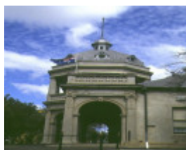
1 returned soldiers hall bendigo front dome