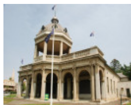
RETURNED SOLDIERS MEMORIAL HALL SOHE 2008