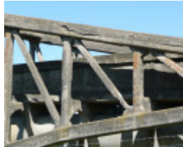
OVOID SEWER AQUEDUCT OVER BARWON RIVER SOHE 2008