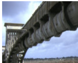
barwon river ovoid sewer aqueduct barwon river geelong view of bottom