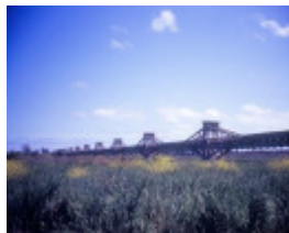
h00895 ovoid sewer aqueduct over barwon river south barwon geelong distant view she project 2004