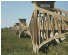
1 barwon river ovoid sewer aqueduct barwon river geelong side view