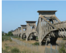
OVOID SEWER AQUEDUCT OVER BARWON RIVER SOHE 2008