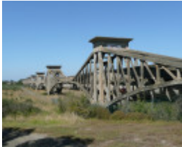
OVOID SEWER AQUEDUCT OVER BARWON RIVER SOHE 2008