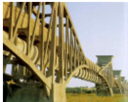
barwon river ovoid sewer aqueduct barwon river geelong site view publication