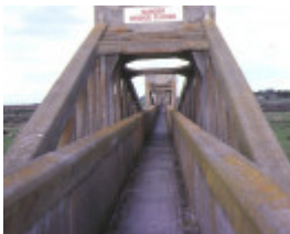
barwon river ovoid sewer aqueduct barwon river geelong view of top aug1988