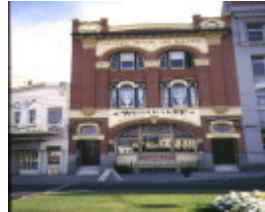
1 former royal bank bendigo front view apr1997