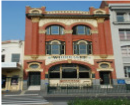
FORMER ROYAL BANK SOHE 2008