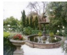
h00192 merchiston hall garden street geelong fountain