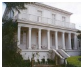
h00192 merchiston hall garden street geelong rear