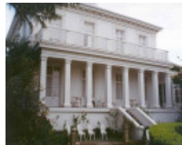
h00192 merchiston hall garden street geelong rear