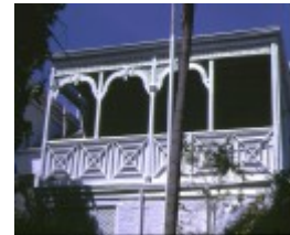
merchiston hall garden street geelong balcony detail