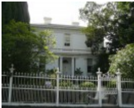
MERCHISTON HALL SOHE 2008