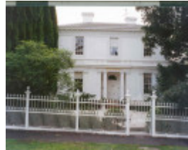
h00192 1 merchiston hall garden street geelong street view