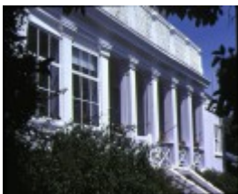
merchiston hall garden street geelong front entrance