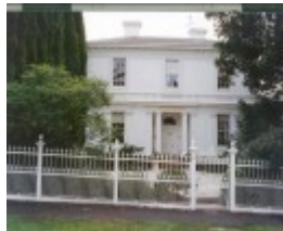
h00192 1 merchiston hall garden street geelong street view