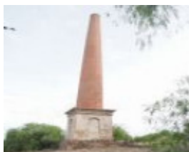
Beehive Co Gold Mine Maldon