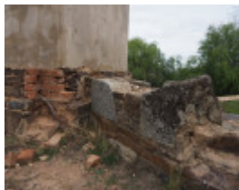
beehive company gold mine 2020