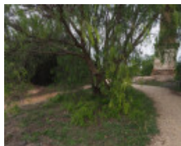
beehive company gold mine 2020