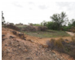
beehive company gold mine 2020