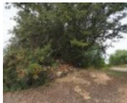
Beehive Co Gold Mine Maldon 1