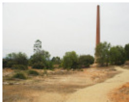
BEEHIVE COMPANY GOLD MINE SOHE 2008