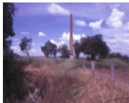
1 beehive company gold mine main street maldon chimney nov1983