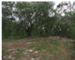
beehive company gold mine 2020