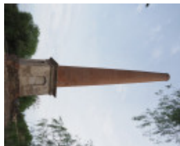
beehive company gold mine 2020