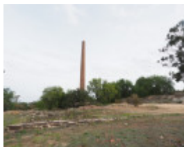
beehive company gold mine 2020