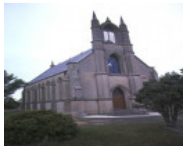
1 holy trinity anglican chruch davy street taradale front view