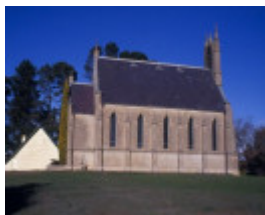
h01350 holy trinity anglican church and sunday school davy street taradale north face she project 2003