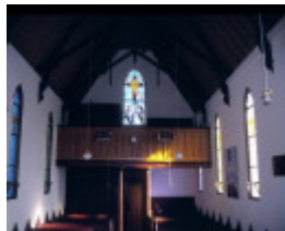
h01350 holy trinity anglican church and sunday school davy street taradale inside church she project 2003