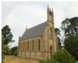
HOLY TRINITY ANGLICAN CHURCH AND SUNDAY SCHOOL HALL SOHE 2008