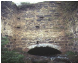
lime4 kiln complex limeburners point geelong kiln detail