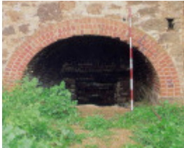
lime kiln complex limeburners point geelong arched entrance publication