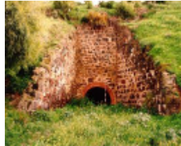
lime kiln complex limeburners point geelong front view