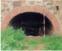
lime kiln complex limeburners point geelong arched entrance publication