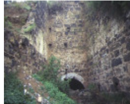
lime kiln complex limeburners point geelong east brickwork detail july 1984