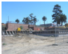
SALTWATER RIVER CROSSING SITE AND FOOTSCRAY WHARVES PRECINCT SOHE 2008