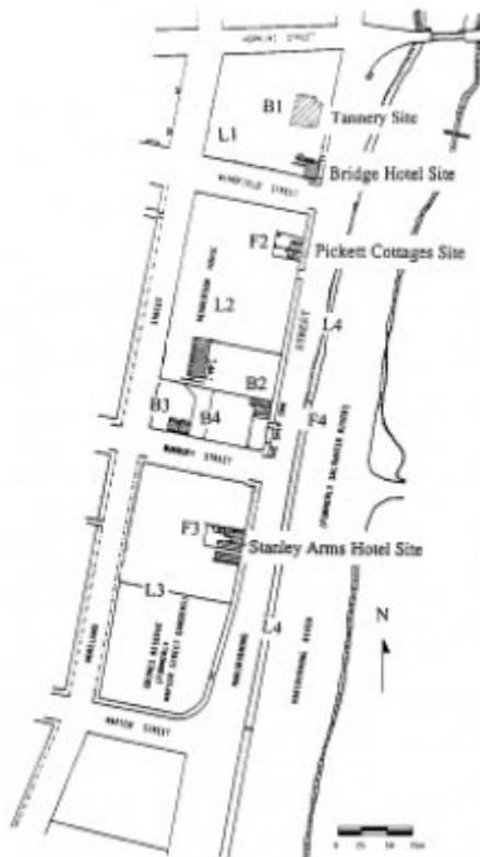
Saltwater River Crossing Site&#x26amp;#x2013; Footscray Wharves Precinct Plan