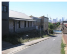
SALTWATER RIVER CROSSING SITE AND FOOTSCRAY WHARVES PRECINCT SOHE 2008