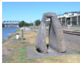
SALTWATER RIVER CROSSING SITE AND FOOTSCRAY WHARVES PRECINCT SOHE 2008