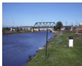
1 saltwater river crossing site & footscray wharves precinct maribyrnong river foreshore aug1988