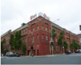
FORMER STRACHAN MURRAY AND SHANNON WOOL WAREHOUSES SOHE 2008