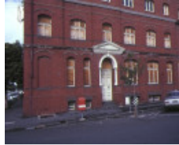
former strachan murray & shannon wool warehouse geelong view of entrance jul1985