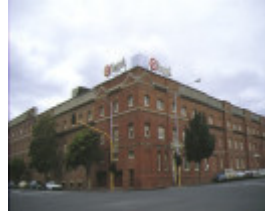
1 former strachan murray & shannon wool warehouse geelong corner view apr1997