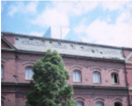
former strachan murray & shannon wool warehouse geelong view of top floor oct1987