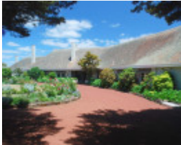
HENDRA SOHE 2008