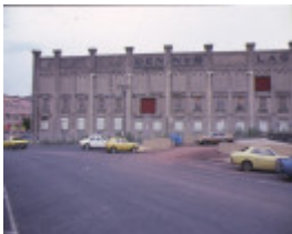
dennys lascelles wool stores geelong front view bow truss building demolished 1990