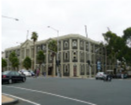
DENNYS LASCELLES WOOL STORES SOHE 2008