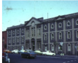
dennys lascelles wool stores geelong front view dennys lascelles feb1970