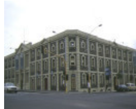
1 dennys lascelles wool stores geelong wool museum apr1997