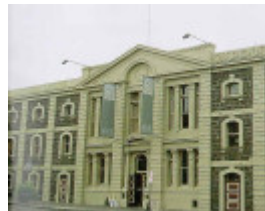
dennys lascelles wool stores geelong wool museum building front view publication