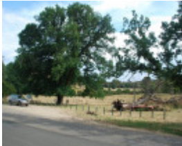
ROYAL OAKS SOHE 2008