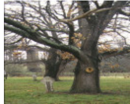
1 royal oaks taradale public park taradlae park view