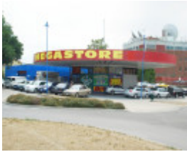
BEAUREPAIRE MOTOR GARAGE SOHE 2008