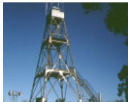
1 mount tarrengower lookout tower mount tarrengower maldon front view feb1997