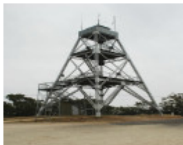
MOUNT TARRENGOWER LOOK-OUT TOWER SOHE 2008