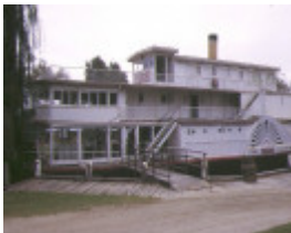
1 paddle steamer gam swan hill pioneer settlement swan hill side view may1998