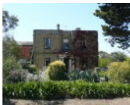
LUNAN HOUSE SOHE 2008