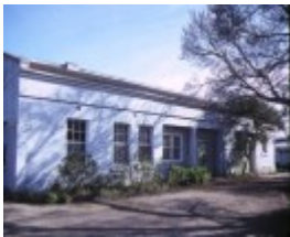
lunan house geelong west side view of wing jul1984