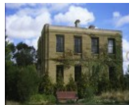
lunan house geelong west rear elevation lunan house apr1997