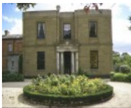
1 lunan house geelong west front elevation lunan house apr1997