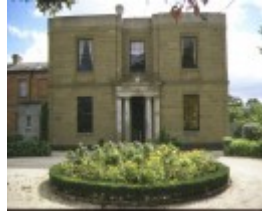
1 lunan house geelong west front elevation lunan house apr1997