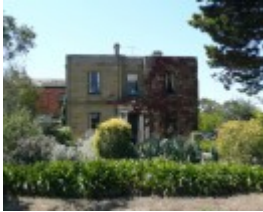
LUNAN HOUSE SOHE 2008