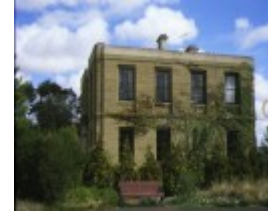
lunan house geelong west rear elevation lunan house apr1997