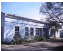
lunan house geelong west side view of wing jul1984