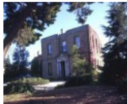
lunan house lunan avenue drumcondra front view