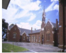
1 primary school number 1566 bendigo front view feb1993