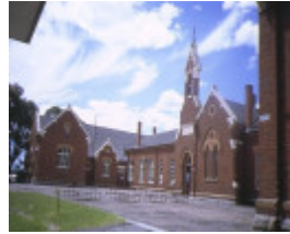
1 primary school number 1566 bendigo front view feb1993