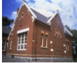
primary school number 1566 side view jan1993