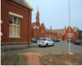
PRIMARY SCHOOL NO. 1566 SOHE 2008