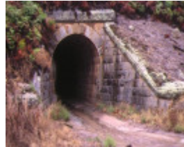
1 ravenswood railway precinct ravenswood arch front view apr1998