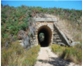
RAVENSWOOD RAILWAY PRECINCT (MURRAY VALLEY RLWY, MELBOURNE TO ECHUCA) SOHE 2008