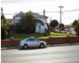
483 Brunswick Rd West