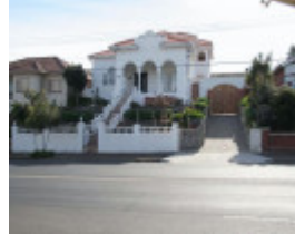
485 Brunswick Rd West