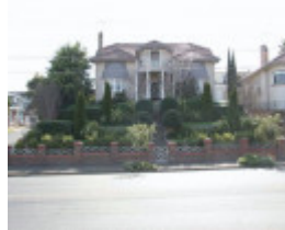
489 Brunswick Rd West