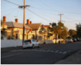
Station Street Coburg