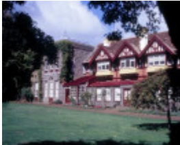
h00289 1 murndal murndal road hamilton homestead