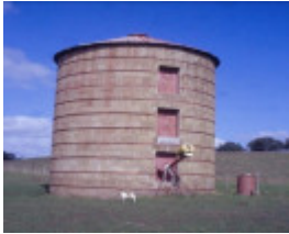
h00289 murndal murndal road hamilton silo