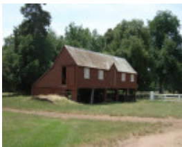
MURNDAL SOHE 2008