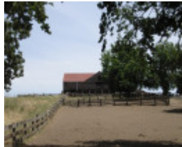
MURNDAL SOHE 2008