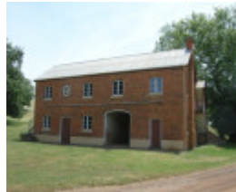
MURNDAL SOHE 2008