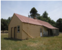
MURNDAL SOHE 2008