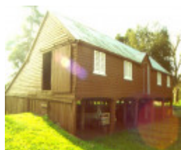
elevated barn Murndal H289 Aug2000