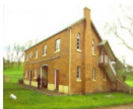
stables Murndal H289 Aug2000