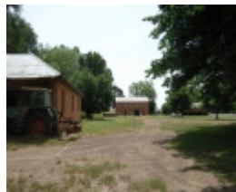
MURNDAL SOHE 2008