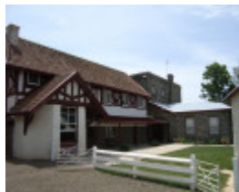
MURNDAL SOHE 2008