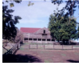
h00289 murndal murndal road hamilton woolshed