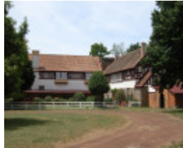
MURNDAL SOHE 2008