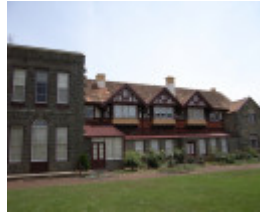
MURNDAL SOHE 2008