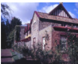
h00289 murndal murndal road hamilton homestead close up