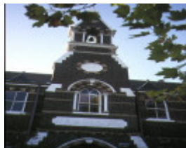
primary school number 1467 malvern road hawthorn detail of bell tower