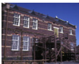
primary school number 1467 malvern road hawthorn side view entrance