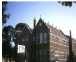
primary school number 1467 malvern road hawthorn rear view 1994