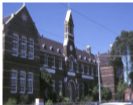
1 primary school number 1467 malvern road hawthorn front view nov1984