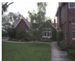
invergowrie hawthorn east elevation