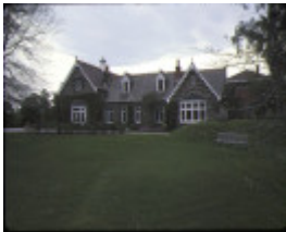
1 invergowrie hawthorn front view