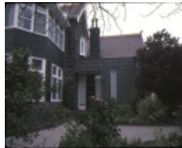
invergowrie hawthorn north west corner