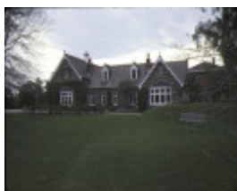
1 invergowrie hawthorn front view