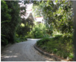
INVERGOWRIE SOHE 2008