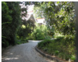
INVERGOWRIE SOHE 2008