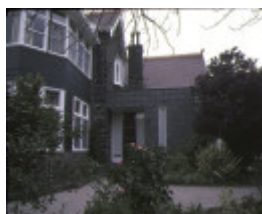
invergowrie hawthorn north west corner