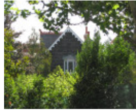
INVERGOWRIE SOHE 2008