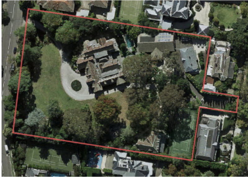
Aerial photo of proposed extent of registration