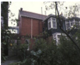
invergowrie hawthorn south west corner