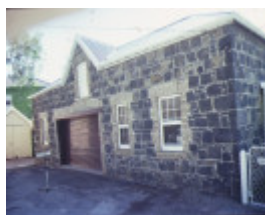
invergowrie hawthorn stables