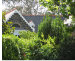
INVERGOWRIE SOHE 2008