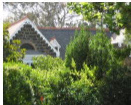
INVERGOWRIE SOHE 2008