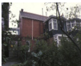
invergowrie hawthorn south west corner