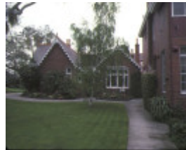
invergowrie hawthorn east elevation