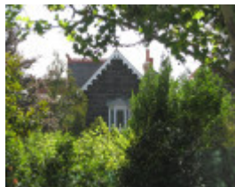
INVERGOWRIE SOHE 2008