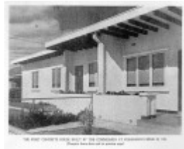
1 concrete houses vhc 1943 annual report