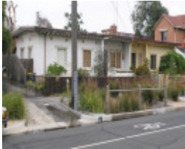
EXPERIMENTAL CONCRETE HOUSES SOHE 2008