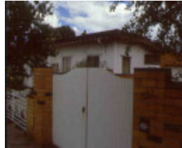
Concrete House Port Melbourne November 1999