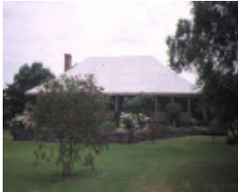
1 fulham balmoral horsham rd kanagulk front view homestead nov1994