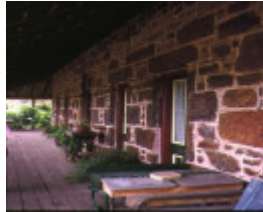
fulham balmoral horsham rd kanagulk front verandah nov1994