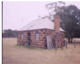
fulham balmoral horsham rd kanagulk overseer's cottage nov1994