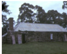
fulham balmoral horsham road kanagulk shearers shed nov1980