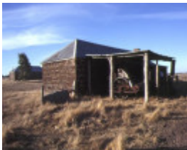
fulham balmoral horsham rd kanagulk woolshed complex feb1980