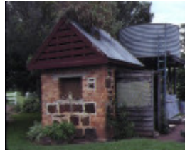
fulham balmoral horsham rd kanagulk meat house nov1980