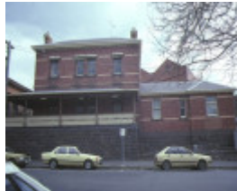
former police station ballarat rear view