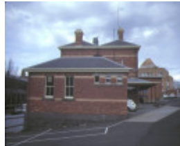
former police station ballarat side elevation