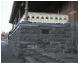
former police station ballarat detail of verandah