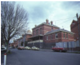
former police station ballarat street view