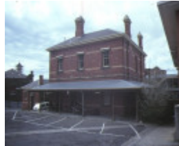
1 former police station ballarat front view