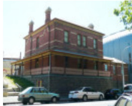
FORMER POLICE STATION SOHE 2008