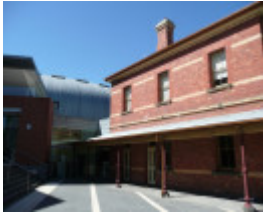
FORMER POLICE STATION SOHE 2008