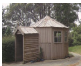
primary school number 1290 bolinda cherokee road kerrie shelter shed dec1998