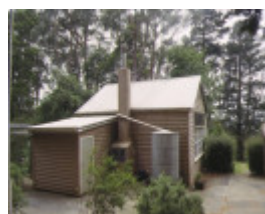
primary school number 1290 bolinda cherokee road kerrie rear elevation dec1998