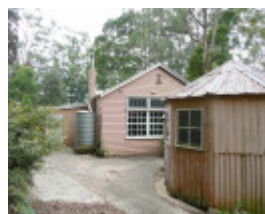
FORMER KERRIE PRIMARY SCHOOL NO.1290 SOHE 2008