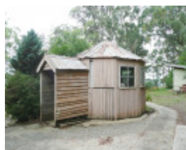
FORMER KERRIE PRIMARY SCHOOL NO.1290 SOHE 2008