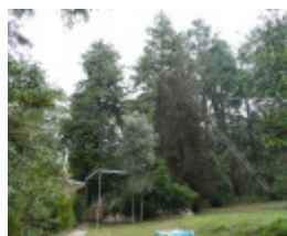
FORMER KERRIE PRIMARY SCHOOL NO.1290 SOHE 2008