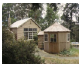
1 primary school number 1290 bolinda cherokee road kerrie property view dec1998