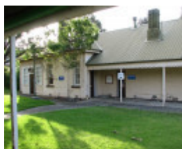
POLICE STATION AND FORMER COURT HOUSE SOHE 2008