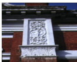
police station & former court house kew detail of attached pillar