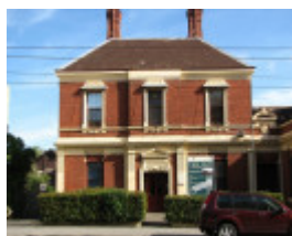
POLICE STATION AND FORMER COURT HOUSE SOHE 2008