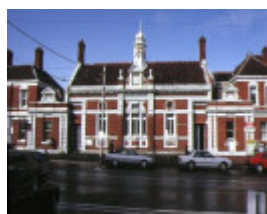
1 police station & former court house kew front view