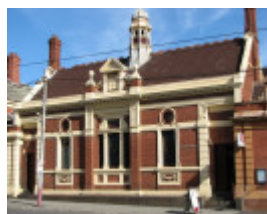
POLICE STATION AND FORMER COURT HOUSE SOHE 2008