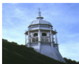
police station & former court house kew detail of tower