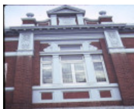
police station & former court house kew detail of front window